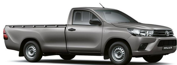
4V8 Avant-Garde Bronze Metallic