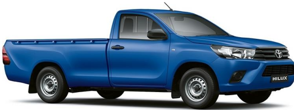
8X2 Nebula Blue Metallic