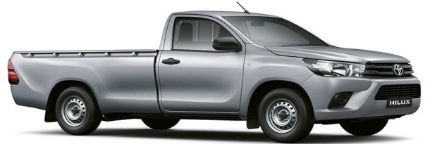
1D6 Silver Metallic