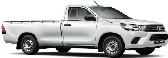
040 Super White II