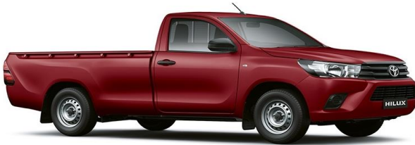
3T6 Red Metallic