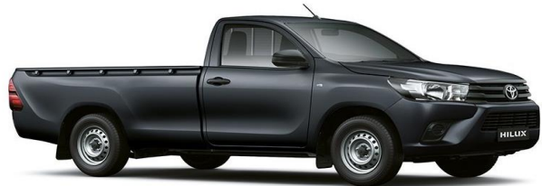
218 Attitude Black