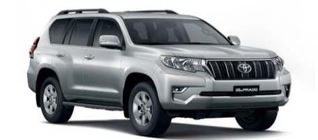
1F7 - Silver Metallic