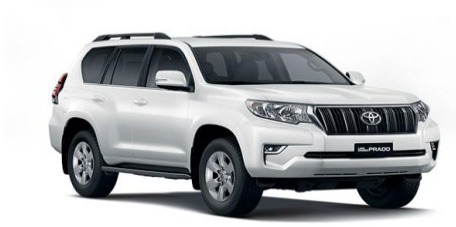
040 - Super White