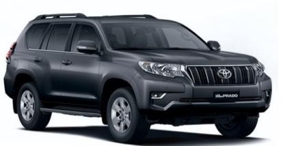
1G3 - Grey Metallic