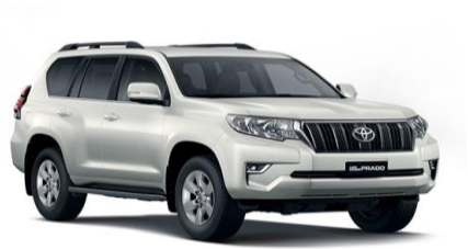
070 - White Pearl