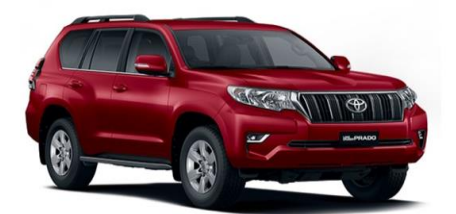
3R3 - Red Mica Metallic