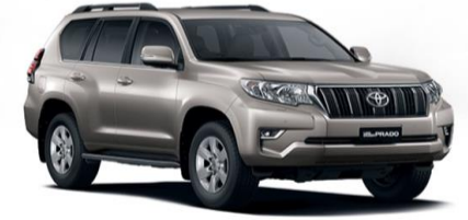
4V8 - Avante-Garde Bronze Metallic