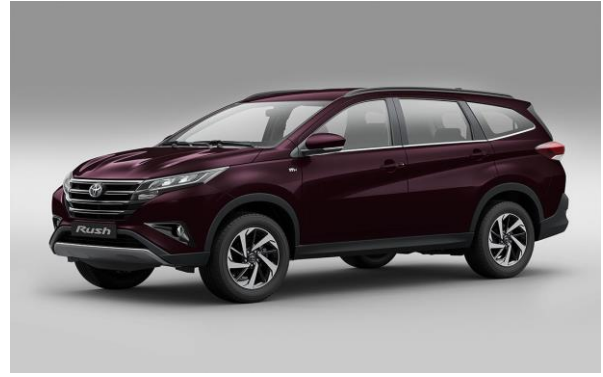
R54 Deep Maroon Metallic