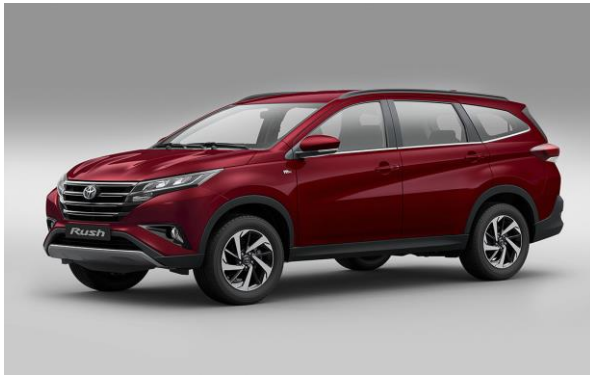
3Q3 Dark Red Mica Metallic