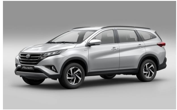
1F7 Silver Mica Metallic