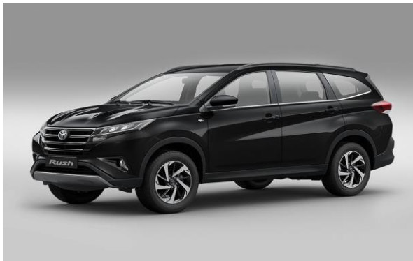
X12 Black Metallic