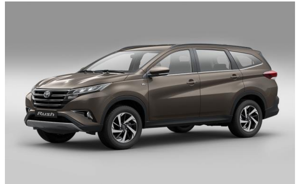
4T3 Bronze Mica Metallic